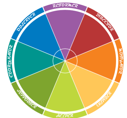
The Insights Discovery 8-Type Wheel